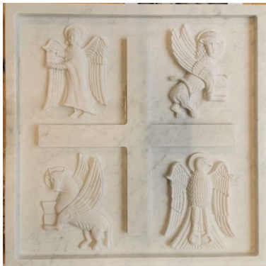
Marble Gospels for Ambo

Thank you all for your support to the St. Pius X Sanctuary Renovation project. Praise God for His blessings.