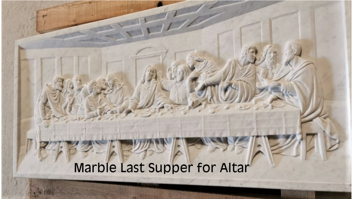
Marble Last Supper for Altar